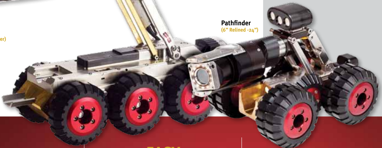
Pathfinder (6" Relined -24")