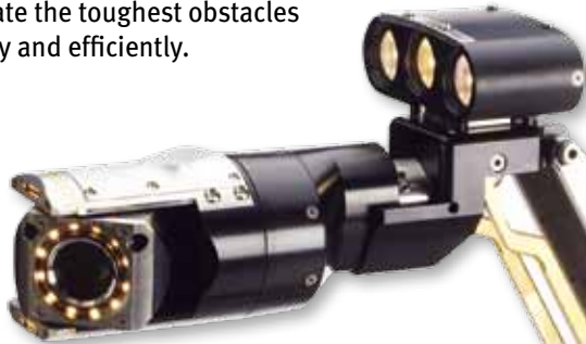
Pathfinder XL (8" Relined and Larger)

The Pathfinder series of sewer inspection equipment offers feature-packed transporters complete with camera lift, rear-facing camera and a powerful, six-wheel, steerable drive to navigate the toughest obstacles quickly and efficiently.